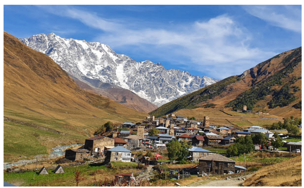
UNESCO list Ushguli Village in Mestia

Day 19 Home. Lands KUL at 8:10AM MON 30 OCT 2023.