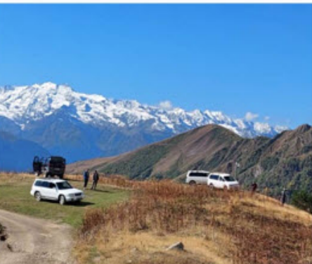
Lake karoldi - hight alpine vegetation

Trip involve several walks and treks. We hire a Mercedes Sprinter with a Georgian guide and a local driver for the duration of this trip. We stay budget hotels and local guesthouses. We use smaller chartered 4WD vehicles for some mountain areas. Large sized 28 inches luggage ARE NOT ALLOWED on Yongo trips. Many Yongers manage with 22 inches but most will use 24 inches trolleys. Note trip cost covers half-board at Mestia 4- nights and half-board at Kutaisi Winery stays (breakfast and dinners).